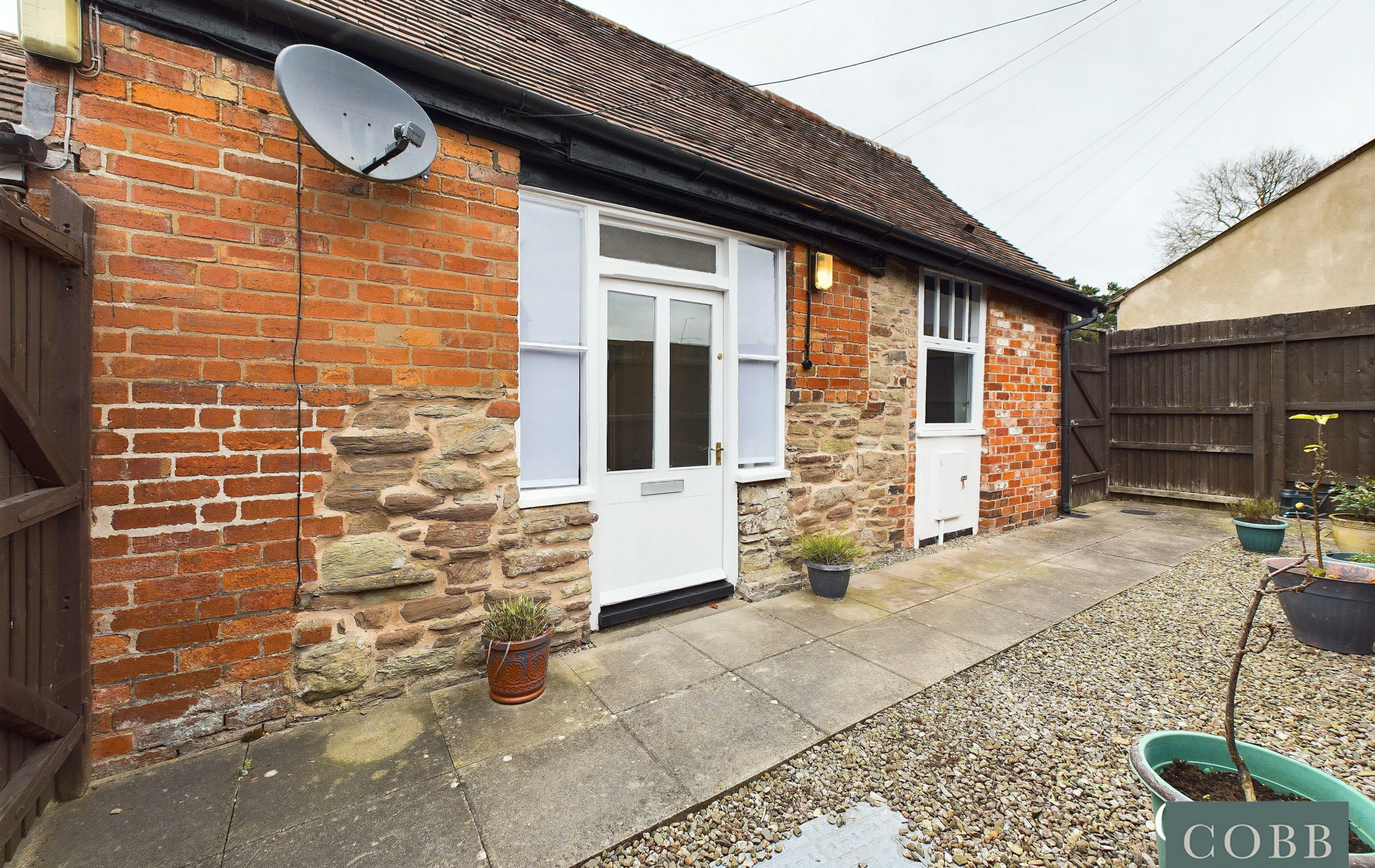
The Courtyard, 11a, School Lane, Leominster, HR6 8AA Price £160,000